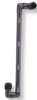
3/4" Threaded x 12" Length

H ave you experienced trouble installing sprinklers to the correct finish grade because you can't find the right riser length? When existing pipes are buried in shallow trenches and you want to retrofit to taller pop-up sprinklers, what can you turn to? Are you having difficulty raising sprinklers that are buried under inches of built-up thatch? Do you want to be sure that