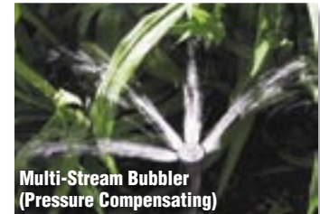
Multi-Stream Bubbler (Pressure Compensating)