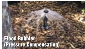
Flood Bubbler (Pressure Compensating)