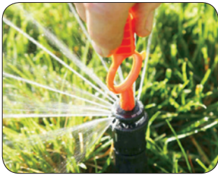
Easy radius adjustment.