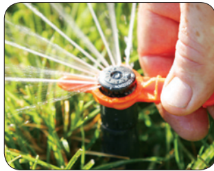
Easy arc adjustment.